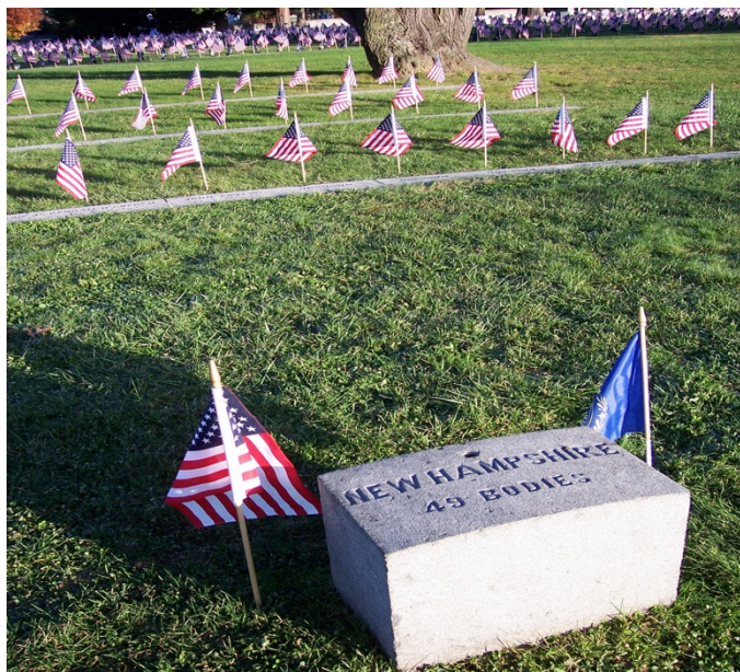
NH graves at Soldiers' Cemetery in Gettysburg

Next year, Epping is celebrating the town's 275th Anniversary. On May 20, 2016, our CWRT-NH is celebrating 25 years meeting in Epping. All are welcome to attend this and all of our meetings in the 2015/2016 season.