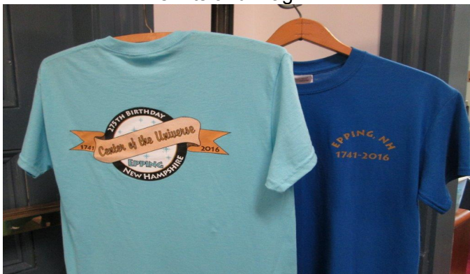
T-shirts and Flag

Birthday Pottery Mugs are for sale for $15, Matching Plates are $20. “Epping Air” soy candles are $15. T-shirts are available in two colors, Royal and Sky Blue, and two sizes, $15 Adult and $12 Youth. Town Flags are $50. All are being sold from the Selectmen’s Office at the Town Hall.